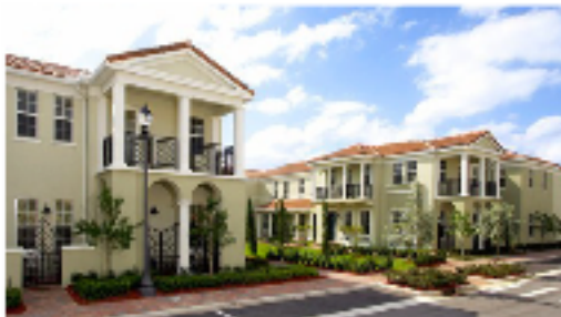
Condos & Townhomes

ON AVERAGE, OUR CUSTOMERS SAVE 30% ON THEIR HOMEOWNERS INSURANCE.