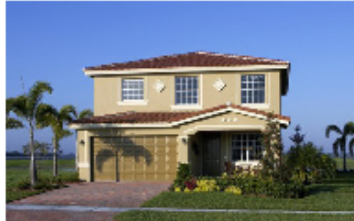
Single Family Homes

ON AVERAGE, OUR CUSTOMERS SAVE 30% ON THEIR HOMEOWNERS INSURANCE.