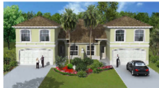
Multifamily and Rental Properties

Call Us at 866-282-2466 or apply online at www.baigonline.com