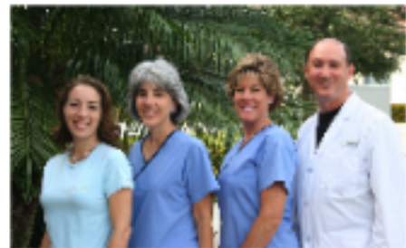
Fixing Smiles Since 1982

Read about our Featured Patients as seen in the