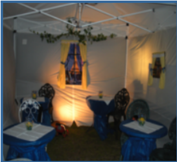
Our bistro with a beautiful view of the Eiffel Tower